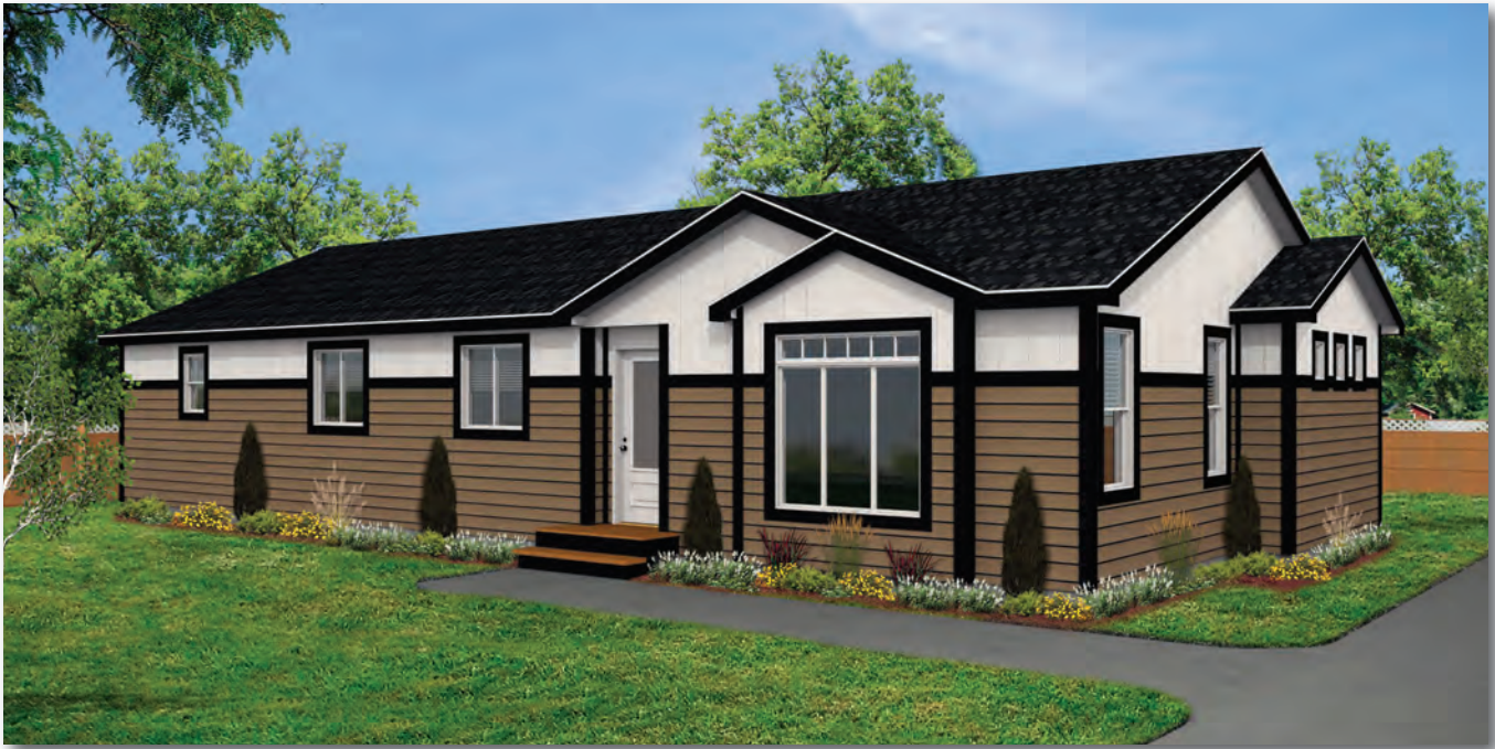
The Dorset ST-7563 27' x 56'/58' • 1,539 sq. ft.

Some exterior features shown may be optional or done by others on site.