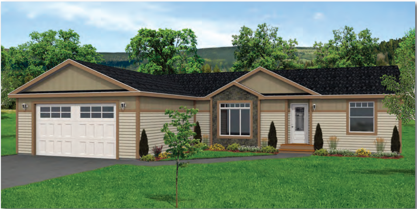
The Cornwall ST-7542 27' x 54' • 1,458 sq. ft.

Some exterior features shown may be optional or done by others on site.