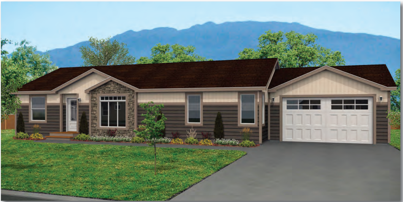
The Suffolk ST-3521 30' x 52' • 1,560 sq. ft.

Some exterior features shown may be optional or done by others on site.